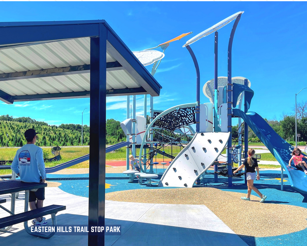
EASTERN HILLS TRAIL STOP PARK