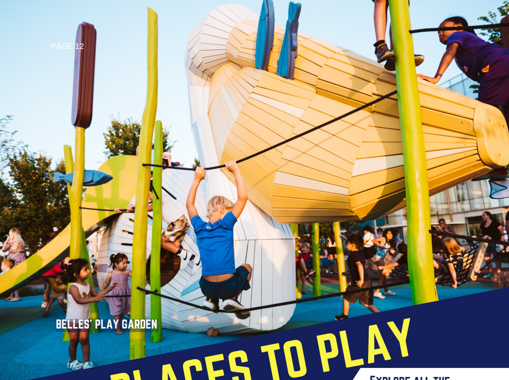
BELLES' PLAY GARDEN