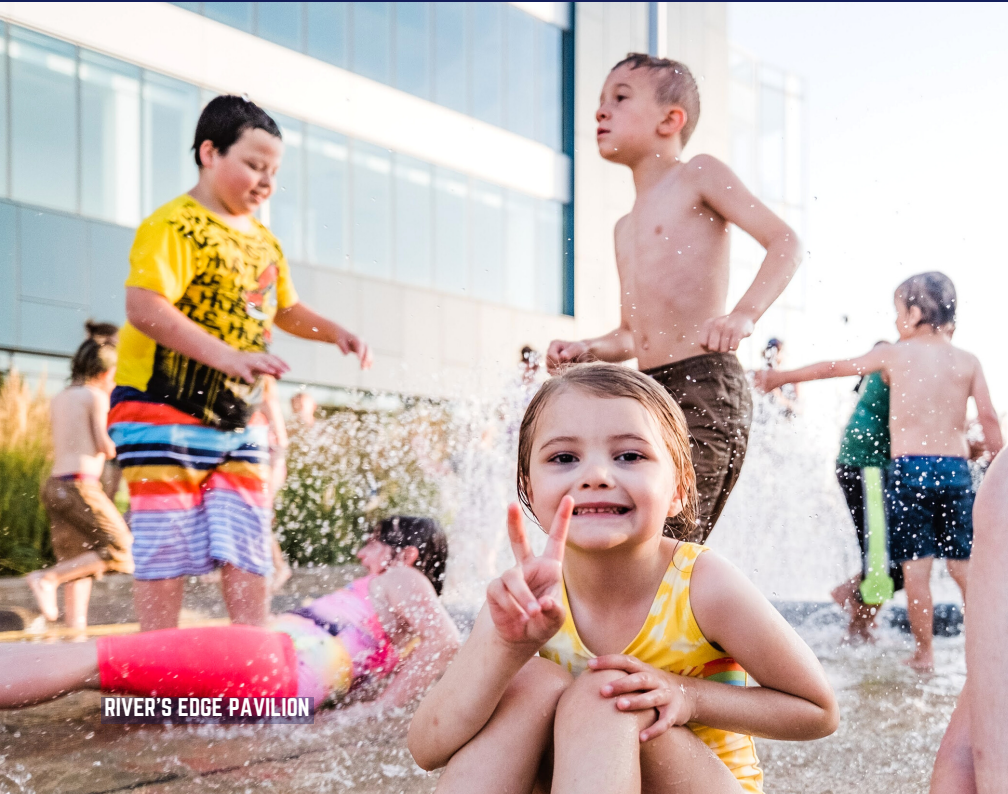
RIVER'S EDGE PAVILION